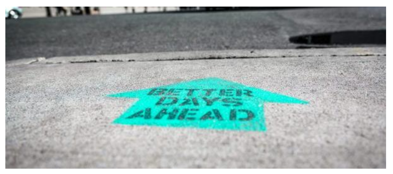
2021: A year for Optimism