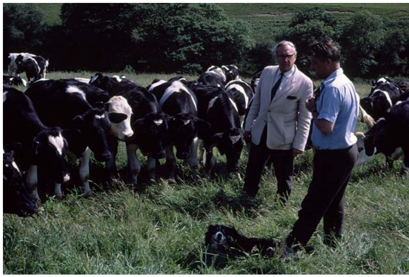
Dairy cattle grazing, Devon, UK