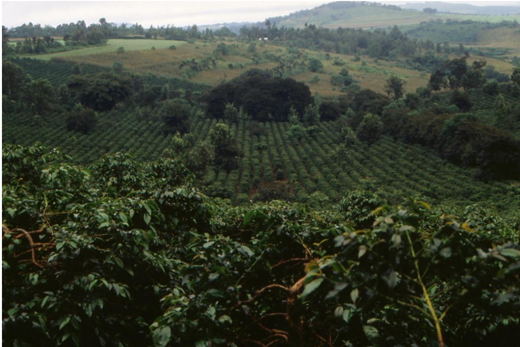
Coffee plantation on Gibb's farm, in Karatu, Arusha, Tanzania