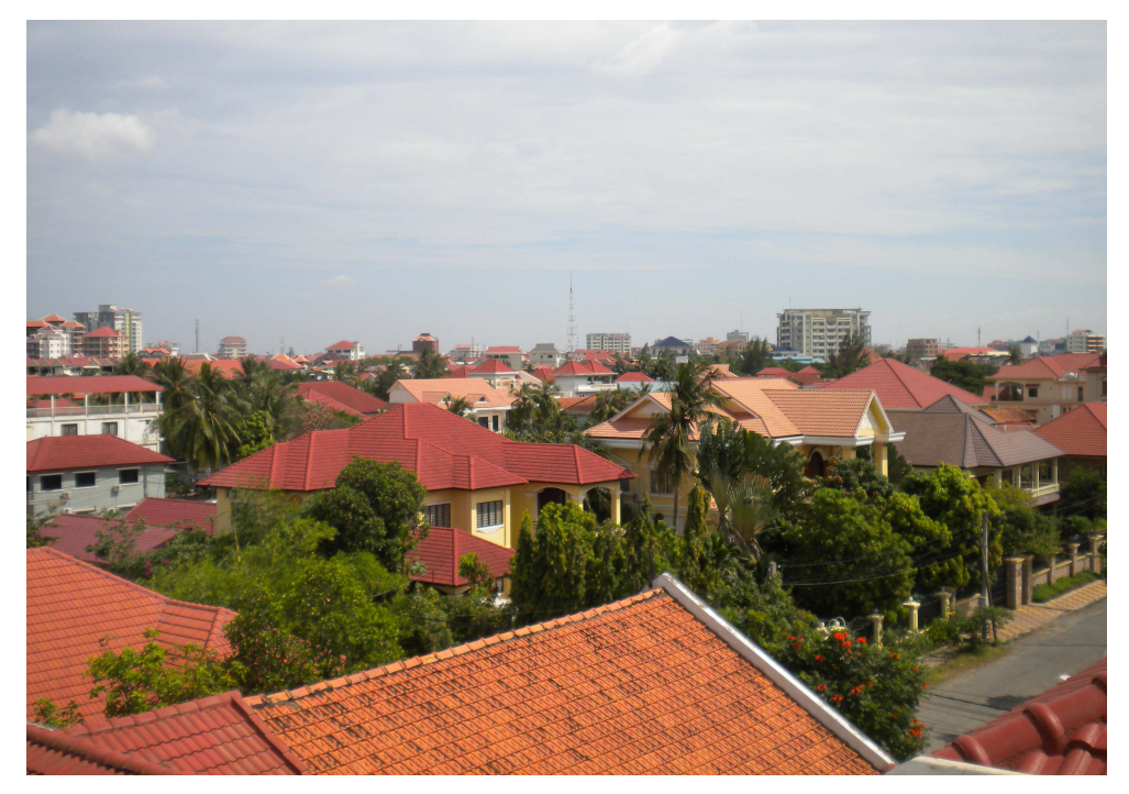
Phnom Penh, Cambodia: View from the rooftop