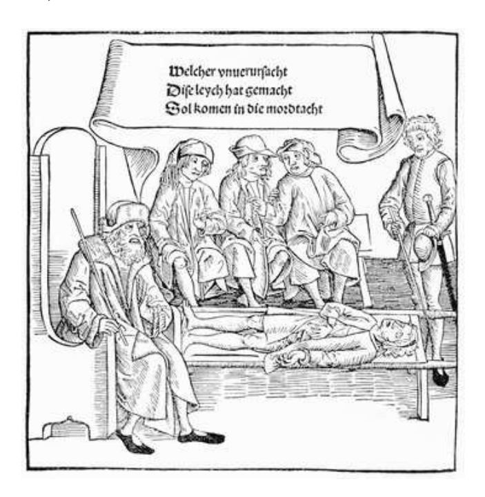
Fig.1 Wood carving from the Constitutio Bambergensis (German penal code as version of 1580), the judge and his jurors look upon a corps. Written above: He who caused this dead body shall suffer proscription for murder .

The Constitutio Criminalis Bambergensis of 1507 is considered a "milestone and turning point in the development of German criminal law" (E. Wolf). She curbed the private complaint in favor of the official law enforcement, fixed the investigative and evidentiary proceedings, clearly defined the offenses and established their corresponding penalties. It managed to increase legal certainty and to connect the criminal process with the substantive criminal law into a unified whole. The Bambergensis of 1507 was created by Johann Freiherr von Schwarzenberg who acted on behalf of the humanist influenced Prince Bishop Georg III. Schenk von Limpurg.