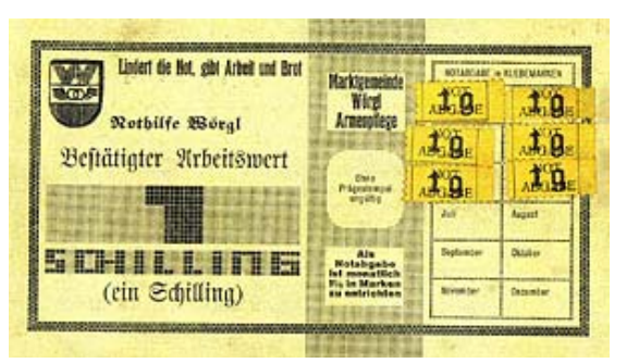
An AB note showing the typical 12 fields for the monthly token stamp

When the program was implemented on the 5<sup>th</sup> July 1932, Unterguggenberger gave the following explantion: