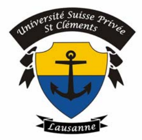
Doctor of Business Management