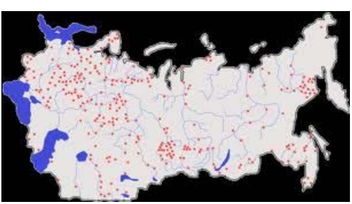
Figure 6:.Why in the name of Country?

The gulags of the USSR were Josef Stalin's pitiless dungeons in which to confine those who dared to seek another political ideal. His paranoid grip on power will remain as a gruesome blot on the pathway that led from the frying pan of despised monarchical hegemony into the fire of violent dictatorship. It is estimated that around 50 million perished in Soviet gulags between 1930 and 1950<sup>6</sup> (Fig.6).