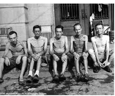
Figure 7: Why in the name of the Emperor?

The Japanese internment camps built to accommodate, torture and murder "the enemy" during WW II and other "hell on earth" facilities built in the name of Country were so-called divine Emperor-sanctioned venues where those who were "different" were maltreated and killed. See Figure 7.