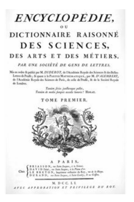
Title page to the Encyclopaedie: http://www. 1902encyclopedia.com/D/DID/denis-diderot.html

The Cordeliers Club card belonging to Robespierre, architect of the French 'Reign of Terror' http://www.histoire-fr.com/revolution_francaise_monarchie_constitutionnelle_2.htm