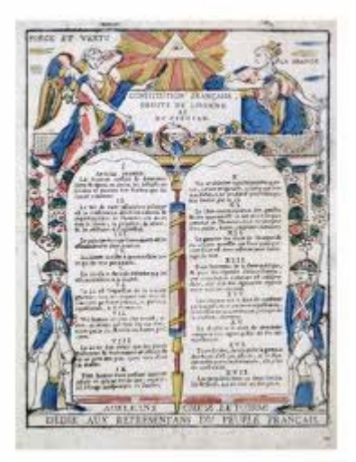
Declaration of the Rights of Man and the Citizen http://libertyeverywhere.blogspot.com/2010/12/declara tion-of-rights-of-man-and.html