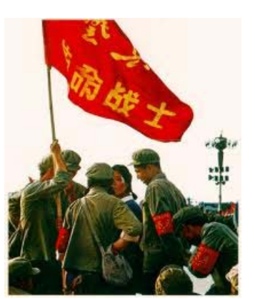
Figure 4: Why in the name of liberation?

Mao Zedong's (1893–1976) genocide ranks high on the list of crimes against humanity where, with Russian complicity, his psychopathic despotism brought sorrow that has left an indelible blot on the history of the Chinese nation, all in the name of the envisaged People's Republic (Fig.4).