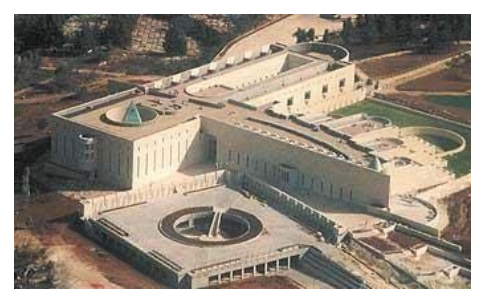
Supreme Court Jerusalem http://www.thegoldenreport.com/special-reports/5-theroots-of-evil-in-jerusalem

Masonic marker at Eilat http://cassiopaea. org/forum/index.php?topic=19165.0