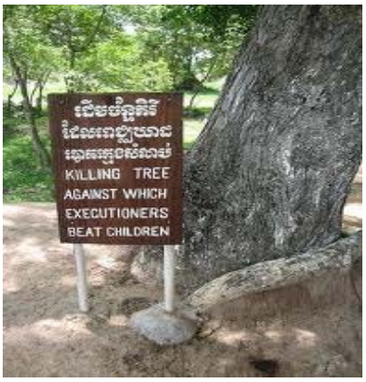
Figure 3: Why in the name of ideology?

Mao Zedong's (1893–1976) genocide ranks high on the list of crimes against humanity where, with Russian complicity, his psychopathic despotism brought sorrow that has left an indelible blot on the history of the Chinese nation, all in the name of the envisaged People's Republic (Fig.4).