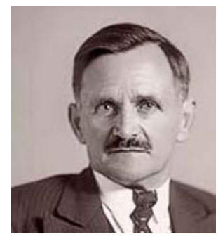
Wörgl Mayor Michael Unterguggenberger

The Wörgl experiment with free flowing money found some resonance in the international press. Unterguggenberger was invited to undertake international lecture tours and the French Finance Minister and later Prime Minister Daladier visited Wörgl in 1933 because of the free flowing money experiment. Further, an economist, Irving Fisher was sent to Wörgl by the American government. Fisher later tried, albeit unsuccessfully, to introduce a Wörgllike money under the name Stamp Scrip in the USA in an attempt to overcome the economic crisis there.