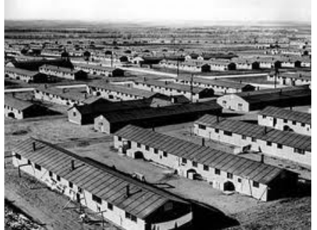
Figure5: Why in the name of Ethnicity?

The evidences of the 15,000 Final Solution camps, constructed throughout Nazi occupied territories (built during 1939–1942) were spawned by Hitler's jingoism and xenophobia. The ghoulish evidence that still challenges a silent deity and impotent world continue to cause shock and horror and stir emotional roots – all in the name of what was called the Third Reich (Fig.5).