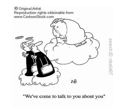
Figure 1: Why in the name of a deity?

genocide, perpetuated and conducted to uphold the honour of the religious deity, the creator God of Abraham, Isaac and Jacob and heavenly father of believers<sup>5</sup>. Other examples are found in Joshua 1:9, 6:1–21 and 8.18,24,25,26, Deuteronomy 7:16 and Numbers 31:1-2 and 17, 18.