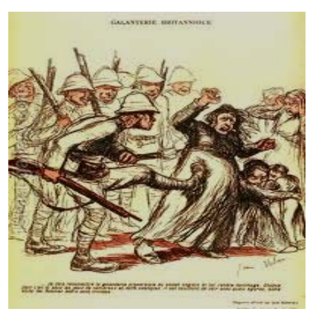
Figure 2: Why in the name of Empire?

Nations throughout the world have had and still maintain their death camps. We remember, for example, the British Empire's internment camps during the Anglo-Boer War (1899-1902). It was here that starvation, brutality and cold-blooded killings took place in the name of a Christian Queen and country (Fig.2).