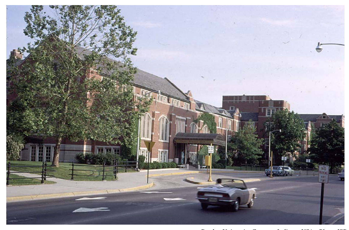
Will Our Universities Survive?