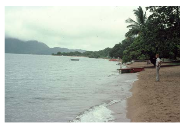
Lake Malawi at Cape Maclear, Malawi

Sub-Saharan Africa probably has the most immediate potential. Mozambique, with its excellent soil, climate and multiple permanent rivers located at regular intervals across the landscape could probably feed the whole of the current African population. The potential of the rift valley lakes also remains virtually untouched. Lake Malawi is a good example. Some 500km long, with a mean width of around 80km and a mean depth of 600m, this Lake contains around 8 million giga-litres of fresh water you can drink. The water is not run-off surface water from rainfall; it derives from 'the fountains of the great deep' (Genesis 7:11, Scholefield 1967). This was confirmed in 1979 when the Lake rose three metres virtually overnight. A German photographer flying over the African lakes at the time took pictures with an infra-red camera; the spirals of water rising out of the rift are evident (Readers Digest, July 1979).