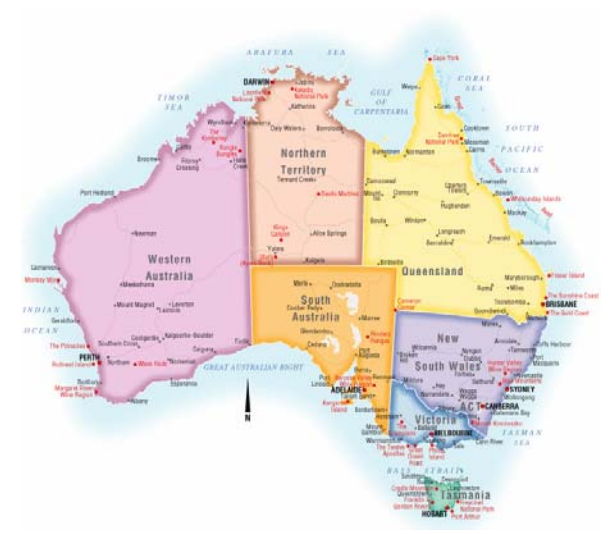
Map 1: Kangaroo Island lies just under the name 'Adelaide' (centre bottom of map); Tasmania is the larger island, bottom right.

within a nation's boundary to provide the basic food and shelter required for life, and this in turn will be determined by both the amount of arable land and the technology that exists to render the land productive.