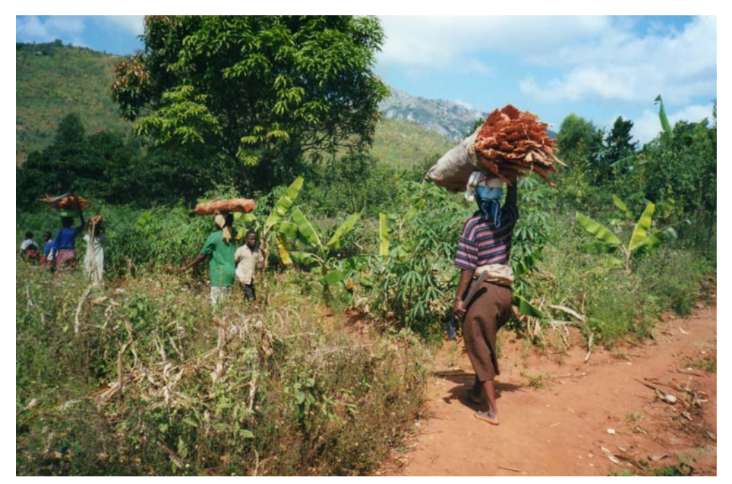
Work in Society: The Daily Grind that Produces Food